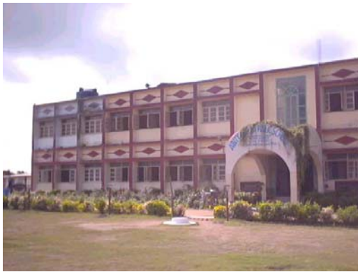
CBSE Affiliated ABCIL School