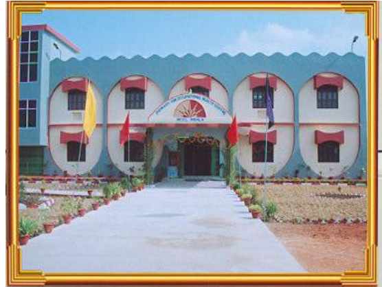
Ultra modern ABCIL hospital