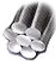
Wire & Strand