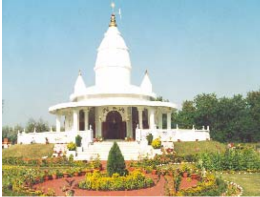
Temple in ABCIL premises