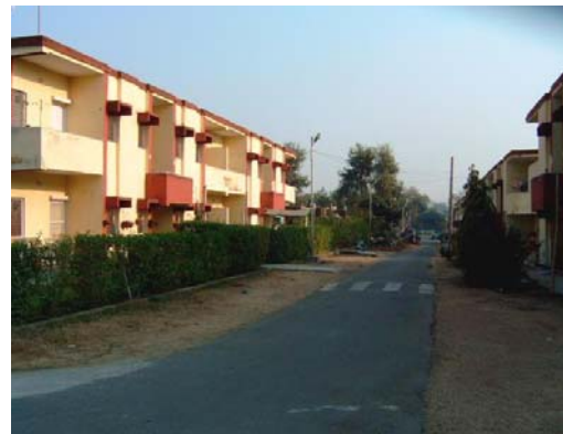
Well Planned ABCIL Colony